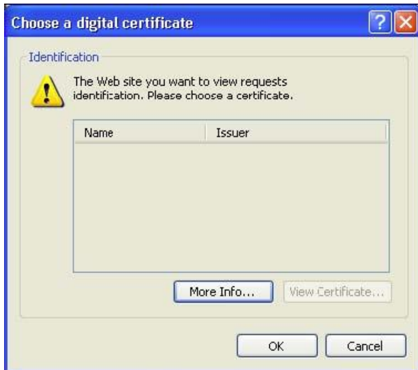
Figure 1: Missing Client Certificate

2. To use a CAC you must have both the DoD Root Certificate and your CAC identity certificate installed on your workstation. These certificates are digital documents that provide the identity of a web site or an individual. If you do not have the DoD Root Certificate or your CAC certificate installed, you should contact your system administrator. If you are requested to choose a certificate where no certificate exists (see Figure 1), you may click "Cancel" to continue accessing ESAMS. Your access to some areas may be restricted.