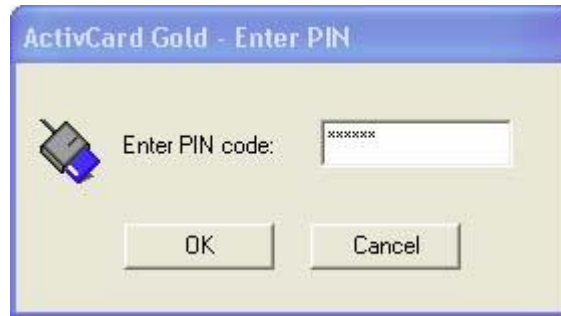
Figure 3: CAC Reader Software - Enter PIN dialog box

8. The CAC Reader Software – Enter PIN dialog box opens (see Figure 3). Enter your PIN (Personal Identification Number) and click the OK button.